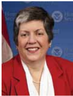
The Honorable Janet Napolitano Governor of Arizona 2004 - 2006