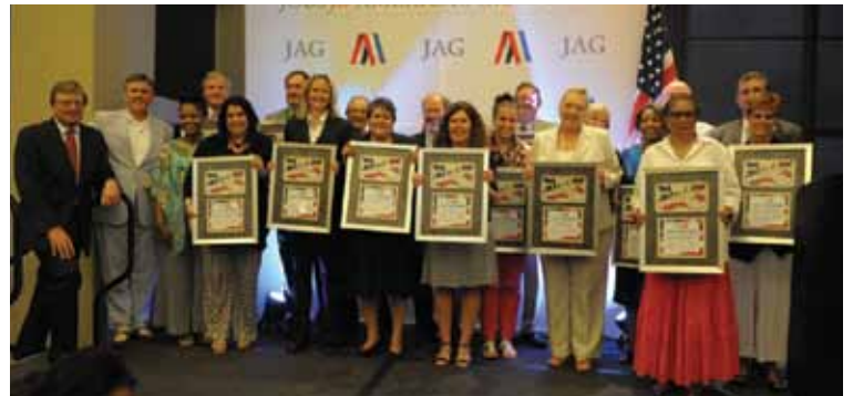
Fourteen states received the JAG "5 of 5" Award

Jobs for Louisiana Graduates and the JAG Board of Directors hosted a reception prior to the Awards Dinner. The reception, attended by state and national leaders and partners, provided the right venue to celebrate the accomplishments of the 2014-2015 program year and prepared delegates for a memorable Awards Dinner.