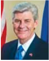
The Honorable Phil Bryant Chair Governor of Mississippi