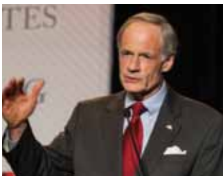
U.S. Senator Tom Carper (DE)