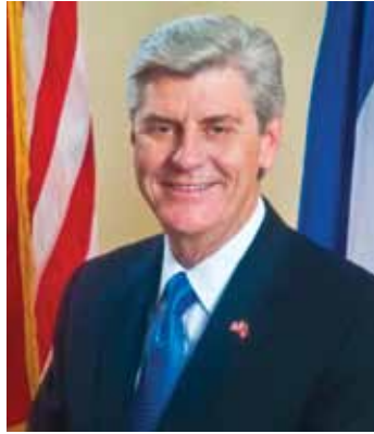
The Honorable Phil Bryant Governor of Mississippi

The National Leadership Award Recipients were submitted by the JAG State Organizations to recognize local and state leaders who have demonstrated a high level of commitment and involvement in the support of JAG Model Programs. The award recipients were recognized at the 2014 Special Recognition Reception and the 2014 Leadership Awards Luncheon. Appreciation and recognition were also given to students who spoke at both events.