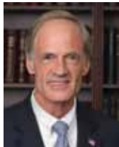
The Honorable Thomas R. Carper United States Senator State of Delaware (2001-current)