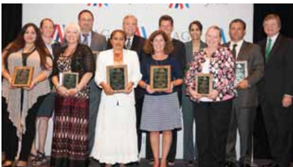
High performance is recognized at the annual National Training Seminar