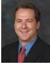
The Honorable Steve Bullock Vice Chair Governor of Montana