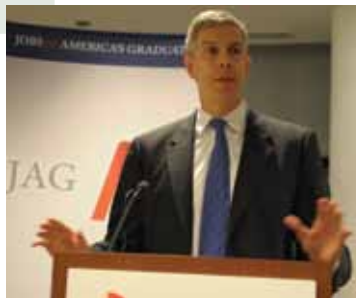
Secretary of Education, Arne Duncan

Early the following morning, the JAG Board of Directors met and adopted the 2015 Plan of Work and Budget and elected officers and directors. This was the regular end-of-year Board of Directors' Meeting.