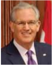
The Honorable Jay Nixon Vice Chair Governor of Missouri