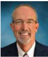
The Honorable Tommy Bice State Superintendent State of Alabama