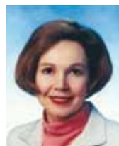
Ms. Julie Nixon Eisenhower Author