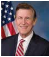
The Honorable Don Beyer United States Representative State of Virginia