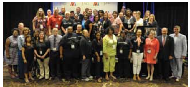
2015 JAG National Network Outstanding Specialists