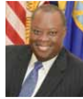
The Honorable Ken Mapp Governor U.S. Virgin Islands