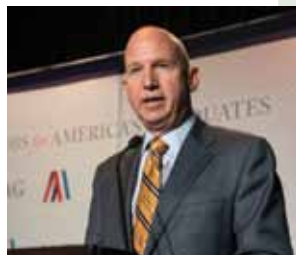
Governor Jack Markell (DE)

The National Leadership Awards Luncheon began promptly at noon. It was the largest gathering of the JAG family in the history of Job's for America's Graduates to celebrate the enrollment of the one-millionth student in one of the 1,000 JAG classrooms somewhere across our 32 states. The event had more than 900 attendees, including 500 of our promising young leaders from around the country. Joining in the recognition were the following: Chair of the JAG Board of Directors Governor Jack Markell of Delaware; Incoming Chair Governor Phil Bryant of Mississippi; and, long-standing supporter and former Board Vice Chair, U.S. Senator Tom Carper. JAG students spoke about the enormous personal impact that JAG had on their lives!