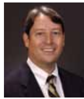
The Honorable Bill Galvano Florida State Senator