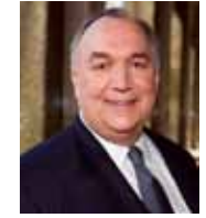
Governor John Engler President Business Roundtable