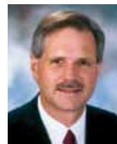
The Honorable John Hoeven United States Senator State of North Dakota (2011-current)