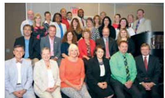
JAG 520: JAG Council of State Affiliates Management Seminar