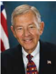
The Honorable George V. Voinovich Governor of Ohio 1996 - 1998