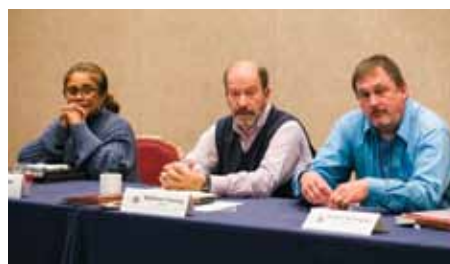
CSA Representatives - AR, KY and KS