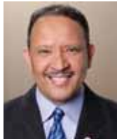
Mr. Marc Morial President National Urban League