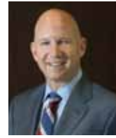
The Honorable Jack Markell Governor of Delaware