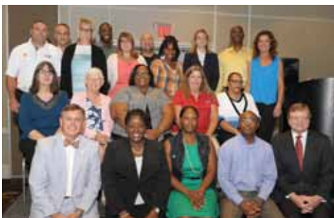
JAG 300: Train-the-Trainer Workshop