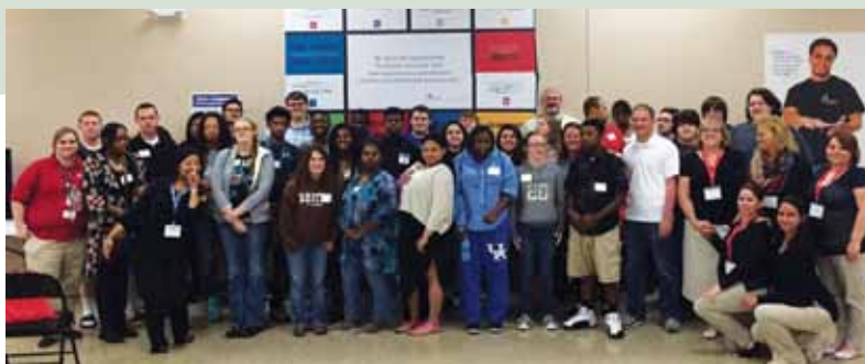
JAG Students visit an Amazon Fulfillment Center with Integrity Staffing Solutions

Integrity Staffing Solutions has forged partnerships with JAG State Affiliates in Arizona, Delaware, Indiana, Kentucky, and Nevada to help connect JAG graduates to employment opportunities with their member companies. In addition, Integrity Staffing has executive level membership on the Jobs for Delaware Graduates Board of Directors and is providing financial assistance to help grow Jobs for Kentucky Graduates.