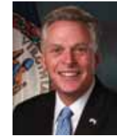
The Honorable Terry McAuliffe Governor of Virginia