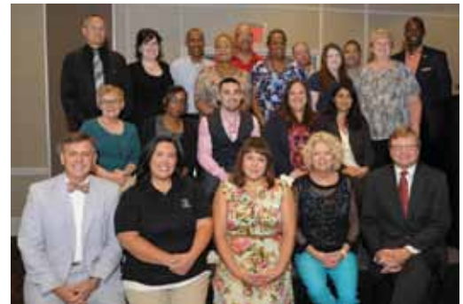
JAG 200: Management Development Institute