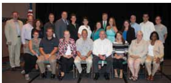
Council of State Affiliates

JAG conducts accreditation reviews including monitoring of the e-NDMS 2.0 database for each state and on-site reviews. The purpose of the accreditation review process is to determine the extent to which the state organizations and local programs have fully implemented the program applications of the JAG Model. The full range of services is mobilized to assist state organizations to receive standard accreditation by the national organization.