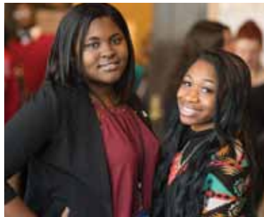
NSLA delegates share plans