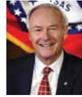
The Honorable Asa Hutchinson Governor of Arkansas