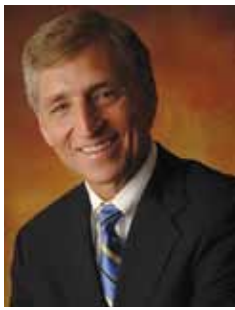
The Honorable Marc Racicot Governor of Montana 1998 - 2002