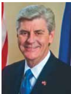
The Honorable Phil Bryant Governor of Mississippi 2015-Current