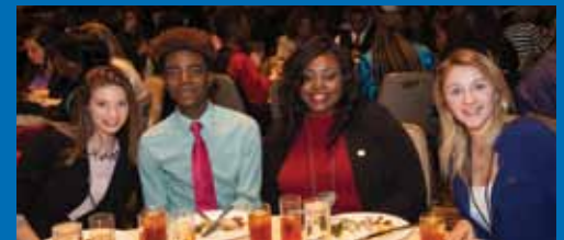
JAG Students attend Leadership Awards Luncheon