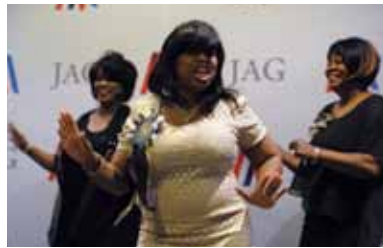
"Stop in the Name of Love"

Perhaps the most exciting and memorable Opening Sessions in JAG's recent history began with JAG-Louisiana delegates parading around the ballroom in traditional Mardi Gras style, throwing beads to the audience. This was followed by a lively musical rendition of "Stop in the Name of Love," by three talented Specialists from Louisiana. The entire audience jumped to their feet to dance and sing in unison with our JAG Louisiana hosts.