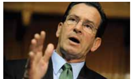
Governor Dannel Malloy