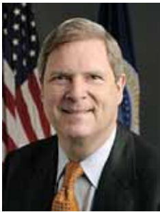
The Honorable Tom Vilsack Governor of Iowa 2003