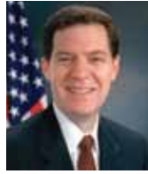
The Honorable Sam Brownback Governor of Kansas