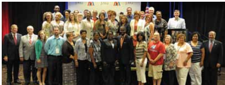
2015 JAG National Network Outstanding Specialists