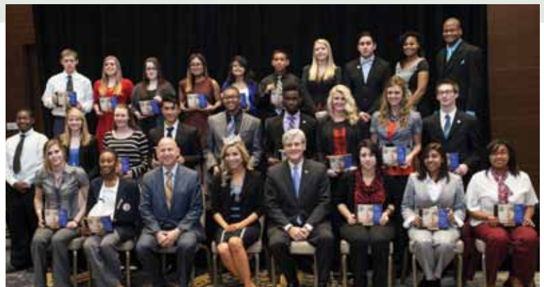
Governors Bryant and Markell with "One Millionth Students"