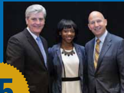
Governors Bryant and Markell congratulate JAG student