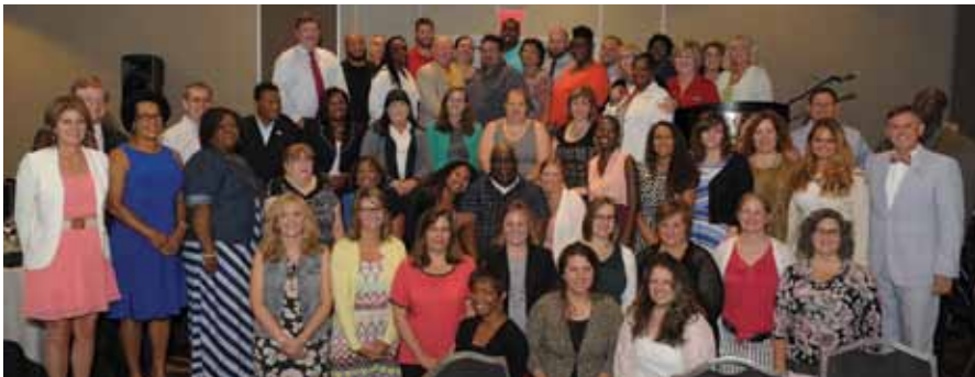
JAG 110: Advanced Specialist Training