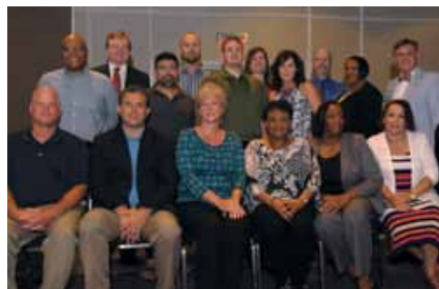
JAG 400: JAG Out-of-School Training Academy