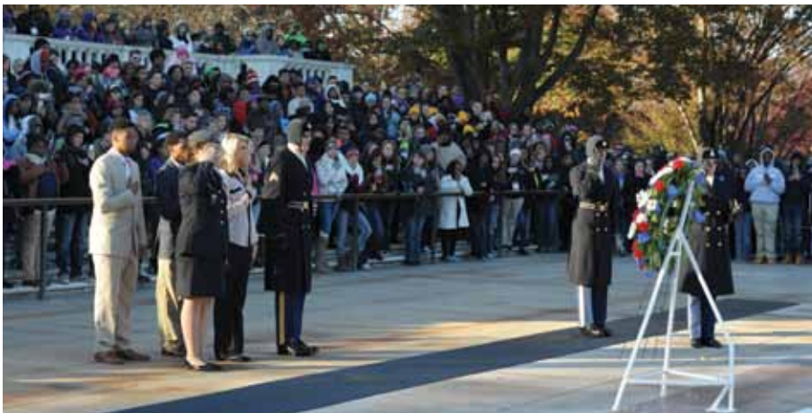
JAG is honored in the changing of the guard ceremony

On Thursday, the delegates registered and loaded on 14 buses for a 30-minute ride to the Marriott Marquis Washington, D.C. to attend the 2014 JAG National Leadership Awards Luncheon with more than 900 guests in attendance. Immediately following the luncheon, the students and chaperones loaded the buses and returned to the Crystal City Gateway Marriott to begin the National Student Leadership Academy. This year's NSLA attracted 145 student competitors in one of the three national events: Employability Skills, Public Speaking, and JAG's newest competitive event – Math Skills. The competitors were judged by JAG partners and the winners announced at the Luncheon on Saturday, November 22.