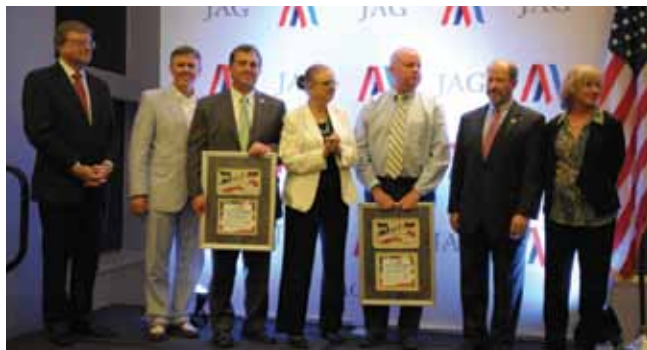
Jobs for Maine's Graduates received the "5 of 5" Award for the 20th consecutive year, Jobs for Ohio's Graduates received the "5 of 5" Award for the 19th consecutive year