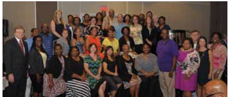
JAG 101: New Specialist Training