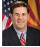
The Honorable Doug Ducey Governor of Arizona