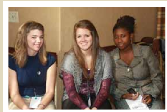
NSLA delegates meet new friends