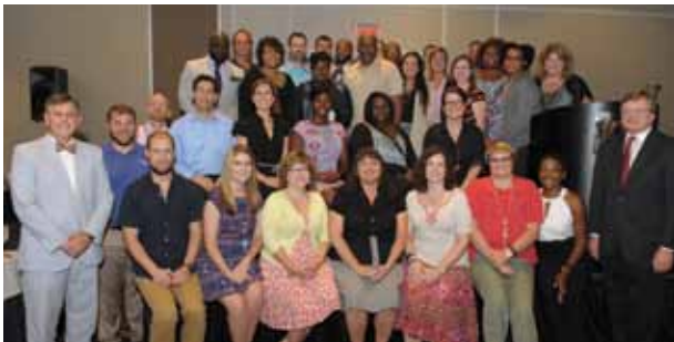
JAG 101: New Specialist Training

Over 260 managers and specialists enrolled in one of seven (7) JAG National University courses that began on Monday, July 13, and concluded with a Recognition Brunch on Wednesday, July 15, in time for the Opening Awards Session of the 32nd National Training Seminar. The professors conducting the courses were JAG national trainers who possess considerable expertise and experience in implementing JAG Model programs that achieve high performance outcomes.