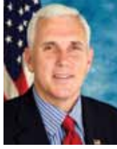
The Honorable Mike Pence Vice Chair Governor of Indiana