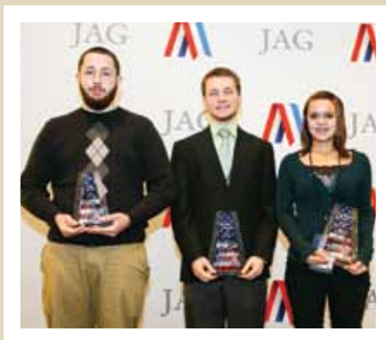
NSLA Award Winners