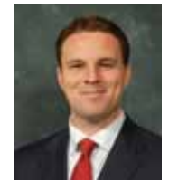
The Honorable Will Weatherford Former Speaker Florida House of Representatives