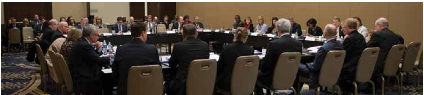
JAG Board of Directors